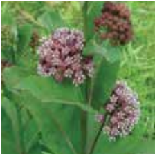
COMMON MILKWEED (N)