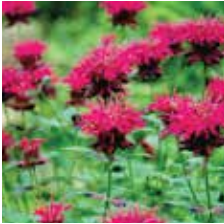
BEE BALM (N)