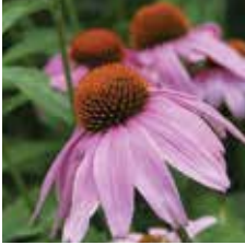
PURPLE CONE FLOWER (N)