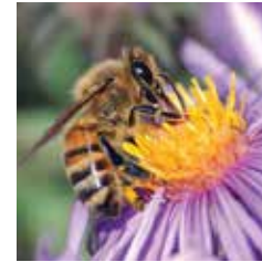
EUROPEAN HONEY BEE

REPORTING: Enter data on iNaturalist! Find iNaturalist instructions at KIBI.ORG/KIBEEES.