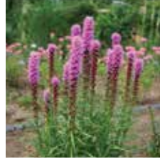
BLAZING STAR (N)