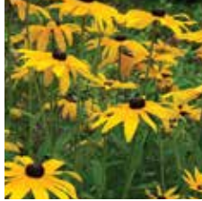
BLACK-EYED SUSAN (N)